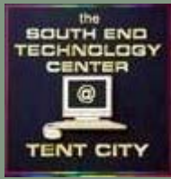
The Path to Change - By Mel King